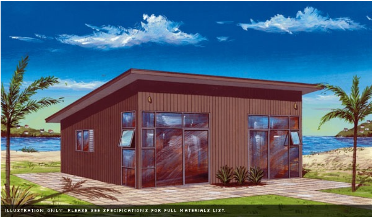
ILLUSTRATION ONLY. PLEASE SEE SPECIFICATIONS FOR FULL MATERIALS LIST.